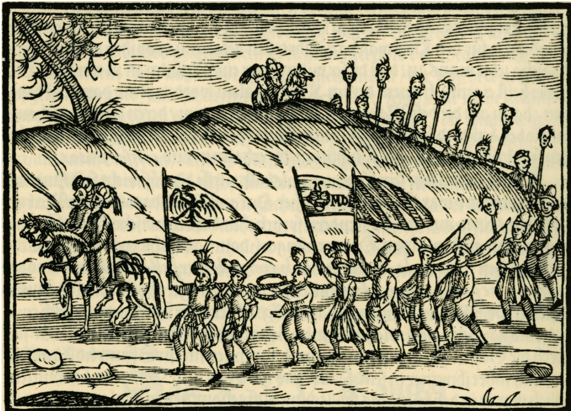
Christian captives taken to Istanbul, in Salomon Schweigger's account of a 1578 journey http://eng.travelogues.gr/item.php?view=47429