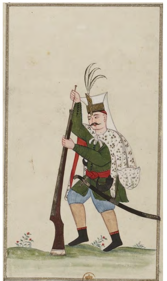
Le Serail et les divers personnages turcs