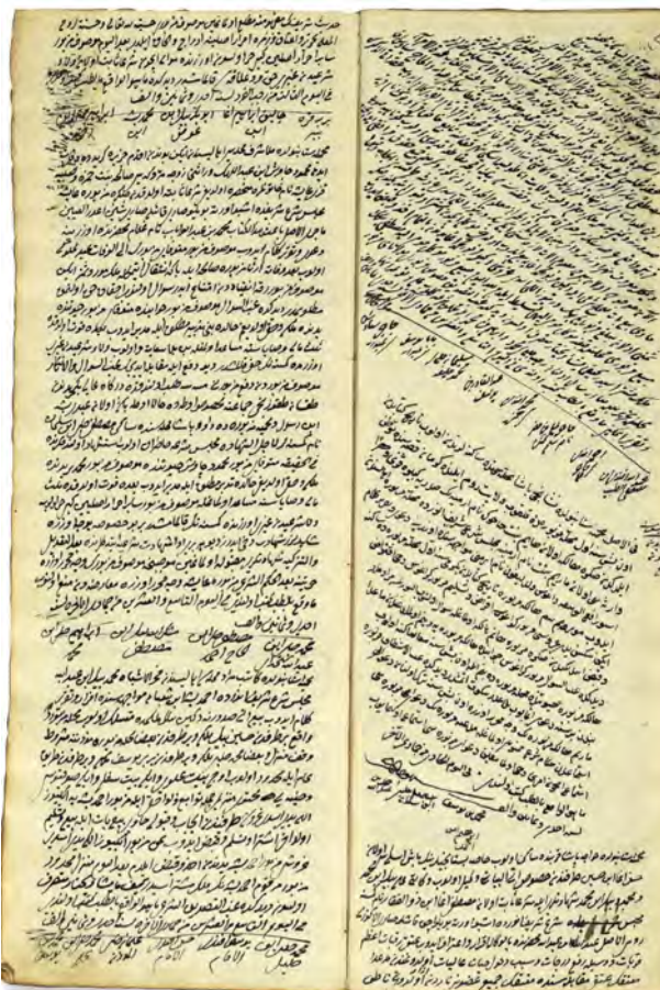
İstanbul Kadı Sicilleri, Bab Mahkemesi, 11. Sicil (1081/1670-71)